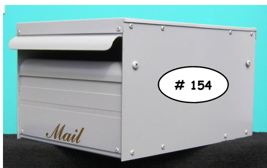
Portrait Fence Box 240 x 330 x 190mm

Manufacturer of Quality Aluminium Letterboxes & Commercial Banks