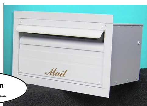
Landscape Fence Box with picture frame 340 x 240 x 190mm