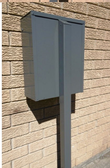
#64 ONE POST, FRONT & REAR VIEW, SUPPORT POST CENTRAL AT REAR