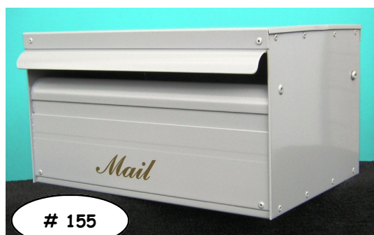
Landscape Fence Box 340 x 240 x 190mm