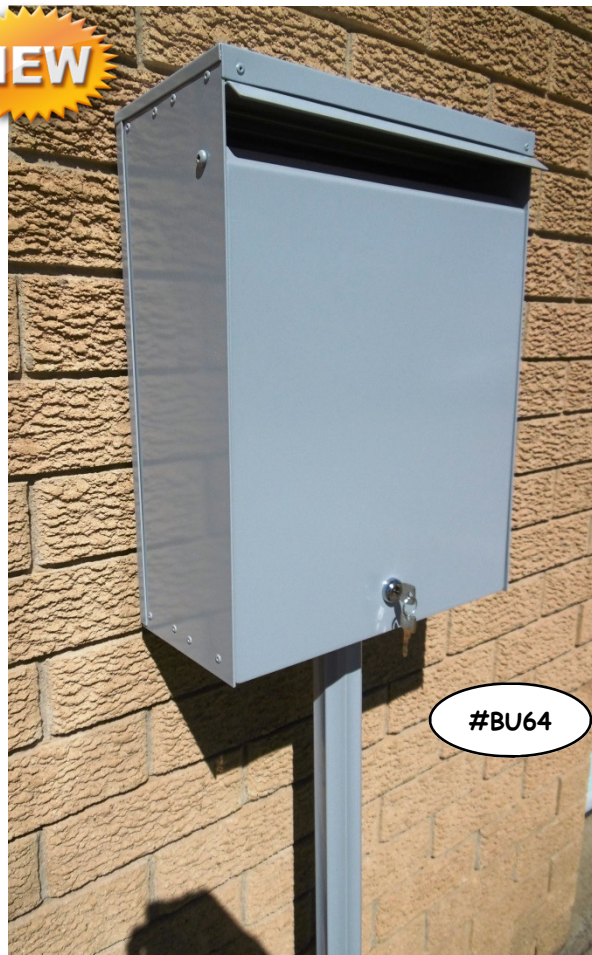
340W X 440H X 150D FRONT OPEN BOX, TOP MOUNTED 100MM POST