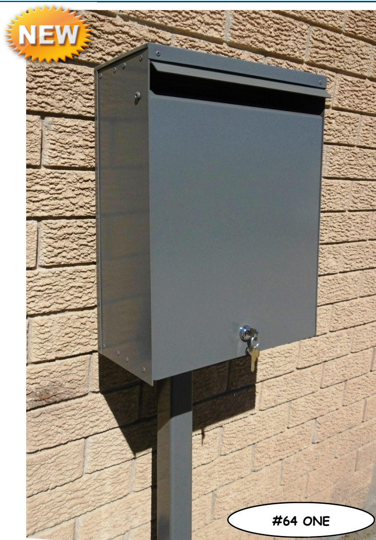
HIGHLINE BOX, 340MM X 450MM X 150MM DEEP + 1 BACK MOUNTED 50 X 50 X 1300MM POST