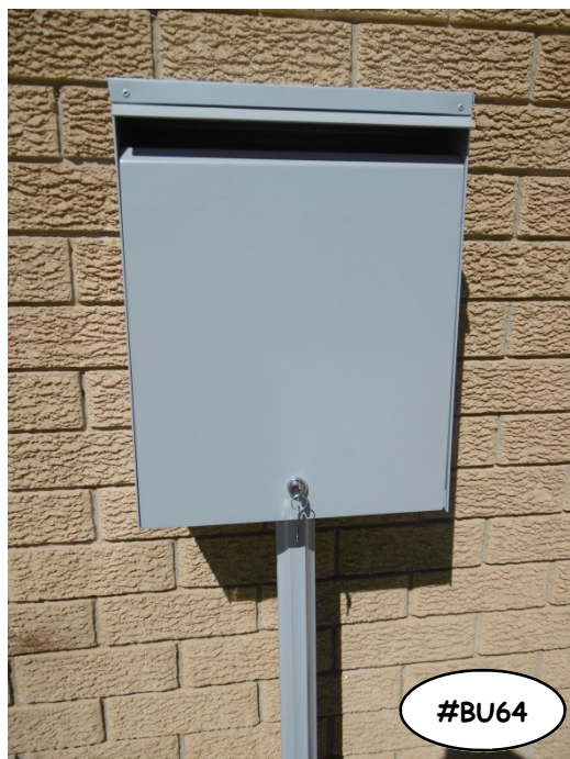
BU64 FRONT VIEW