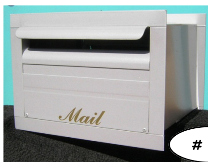
Brick in Front & Back 240mm. Sleeved to fit.