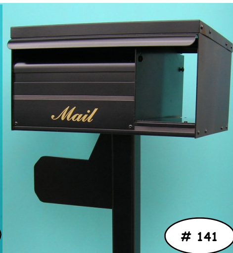
Square Line 240 mm with paper holder