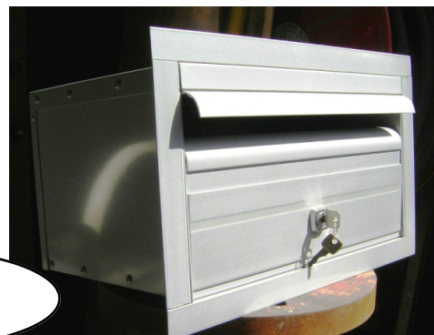
Front opening fence box 340mm.