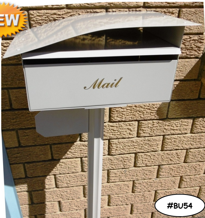
SAIL 340MM X 240MM, REAR OPEN, ON 1000MM FLUTED POST